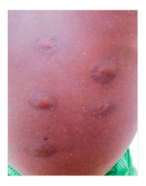
Figure 1: Traditional treatment of Visceral Leishmaniasis through heat therapy